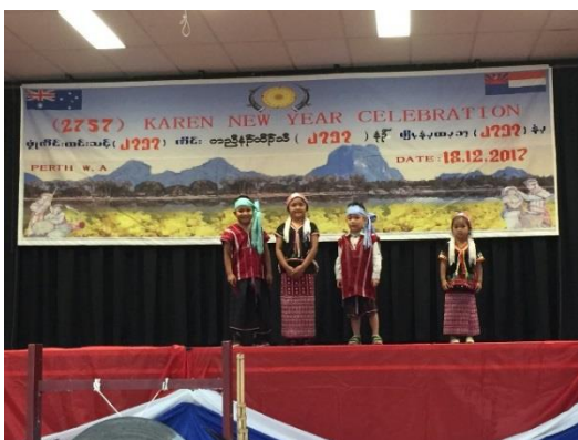
Karen New Year Performers