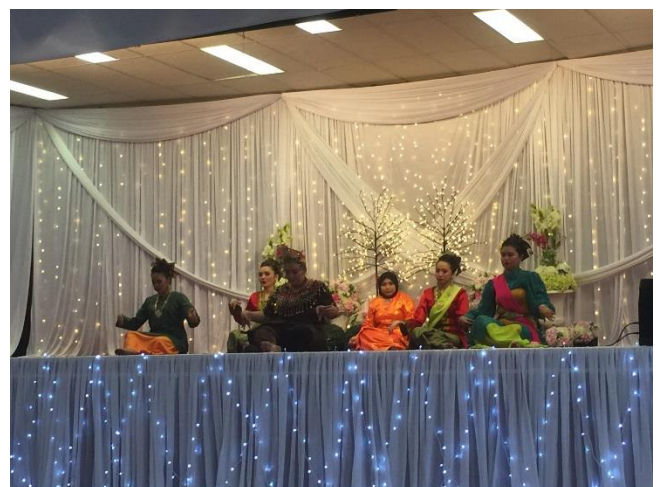
Malay Cultural Event of the Year Performers