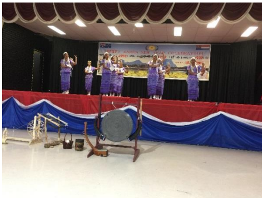
Karen New Year Performers